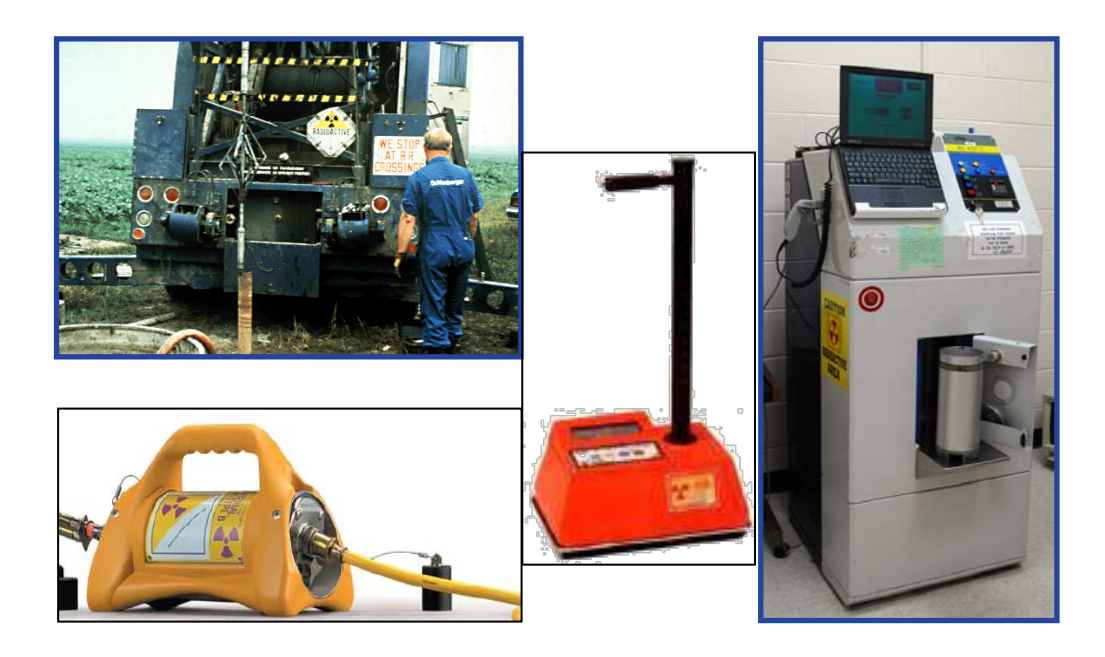
Figure 1: Beneficial Applications of Sealed Sources (Clockwise from top left). Well logging, Gauging (for moisture density and other types of measurements), Irradiation (blood), Radiography

While the number of beneficial uses has multiplied, the pathways for final disposition either never existed (in many countries) or have decreased. Many sources manufactured in the U.S. and other countries have already or are now reaching the end of their useful life due either to decay of the radioactive isotope, fatigue of the metal encapsulating material or sealing welds, or simple exceedance of their design life. As a result, many sealed sources are becoming disused and unwanted concurrently with the lack of a disposal pathway for their final disposition. This combination of wide beneficial use and lack of a disposal/end-of-life pathway leads to vulnerable sources that can fall out of regulatory control over time and, in some cases, accumulate. The unique concerns posed by concentrated radioactive material that is disused and not adequately controlled have been articulated many times over the history of the DOE OSRP, including the following by the European Commission: "...the sources at greatest risk of being lost from regulatory control are disused (unwanted) sources held in local storage at the user's premises waiting for final disposal or return to manufacturer"... [2]. The U.S. Government Accounting Office (GAO) also mentioned that the consequences of a radiological material dispersal "Even without an intentional act...can lead to radiation exposure, high decontamination costs, and public panic" [3].