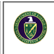
Keeping on course