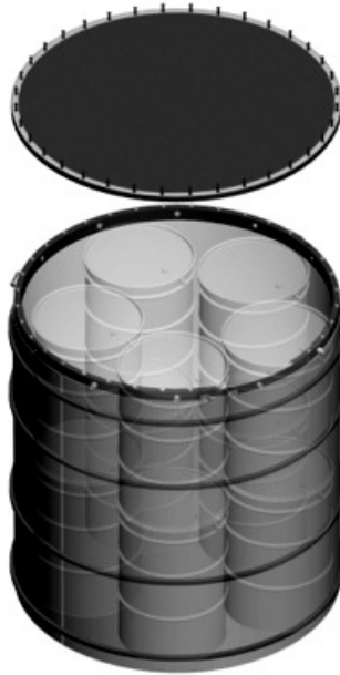
TDOP - The largest of the WIPP overpacks.

Vacationers use the words "over packed" in the negative as they struggle to close suitcase zippers. At WIPP, overpacking is a real plus. It's not about compressing contents to fit the container: overpacking is a cost-effective means of packaging potentially damaged TRU waste drums so that they will be safe to handle and ship.