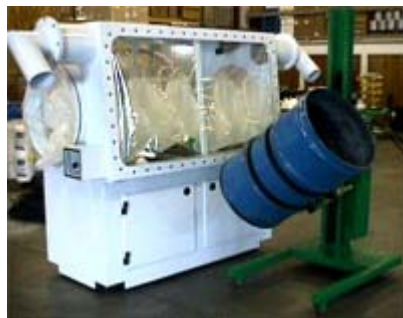
Technicians use glove boxes to visually examine drum contents.

There are three basic applications for visual examination: (1) examination of newly generated waste prior to packaging or repackaging from an old to new container; (2) visual examination in lieu of radiography or (3) a quality control check on drums that are already characterized and certified to verify the accuracy of radiography.