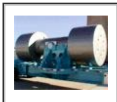
By the numbers