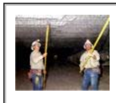
Sounding the back