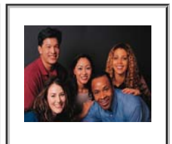
Our Team News