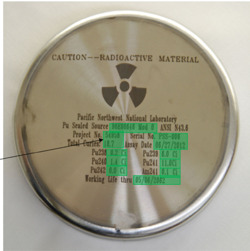
Overall Dimensions: 4.581 in. dia. x 0.70 in. thick